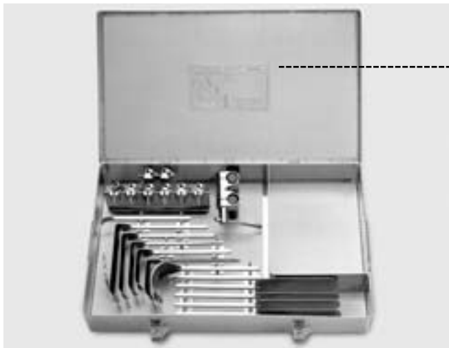
BOOKWALTER Blades and Accessories Case Product Code #50-4508