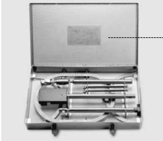
BOOKWALTER Table Fixation and Ring Case Product Code #50-4507

N ow a better way to sterilize, store, and maintain your BOOKWALTER System and related components!